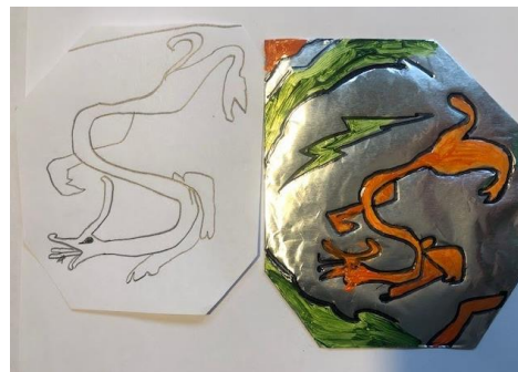
Y4 Anglo-Saxon brooches - Ben S

In the meantime, we hope all of our instrumentalists are maintaining a healthy practice routine, and we all look forward to the time when we can hear our young musicians 'wowing' us with their performances in assemblies and concerts.