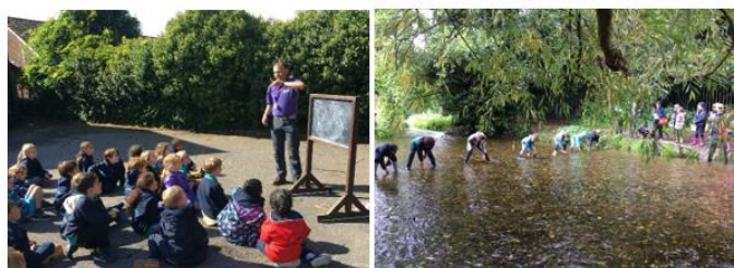
Y3 enjoyed testing the speed of the river with Pinky the rubber duck!

This important fund supports the school in order to provide the wealth of activities/events that help to bring the curriculum alive. We do not ask for a payment every time your child is engaged in one of these opportunities. For example, the Voluntary Contribution made by the Y3 parents went towards the cost of the visit (coaches and workshops) to Horton Kirby. While we may not be able to get out and about quite as much as we usually do, the teaching team are being incredibly creative to find alternative ways to enrich the curriculum. We have the Young Shakespeare Company lined-up for Y6, followed by more theatrics from the Freshwater Theatre Company delivering a 'Windrush' workshop for Y3. Open View Education will be joining us to deliver Anti-Bullying assemblies and workshops across the school. Y5 and Y6 are going to be re-visiting Horton Kirby for Victorian and WWII experiences, and a little further down the line, Y4 have Portals from the Past visiting and will be off to Battle! Phew, I'm exhausted thinking about it all... Thank you all in advance for your contributions to help us make this all happen for our Hamleteers.