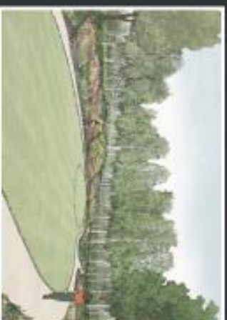
Architects' 'impression of the reimagined meadow' © JF_DO