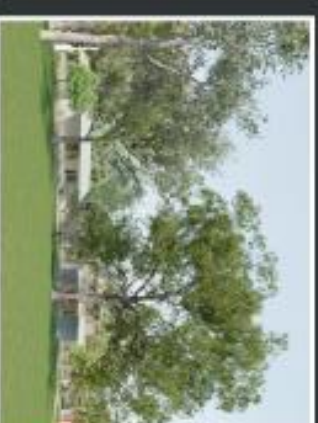
Architects' 'impression of a new building for schools and families' © Carmody Groarke

Please join us to see the plans, meet the team behind the project, and share your thoughts. All feedback will be considered in the design and review process.