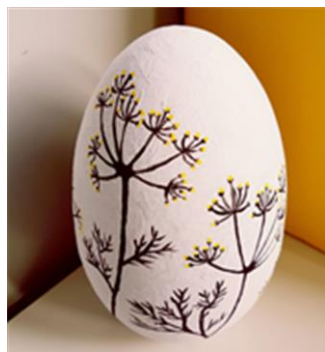
'The Dill Egg'

What we didn't know when we advertised the 'Dulwich Village Easter Egg Hunt' last week was that our very own and exceptionally talented Miss Pink had designed one of the eggs: 'The Dill Egg'. It's absolutely beautiful. The design is based on the origin of Dulwich's name, which comes from the Anglo-Saxon 'Dilwyhs', meaning 'the meadow where dill grew'.